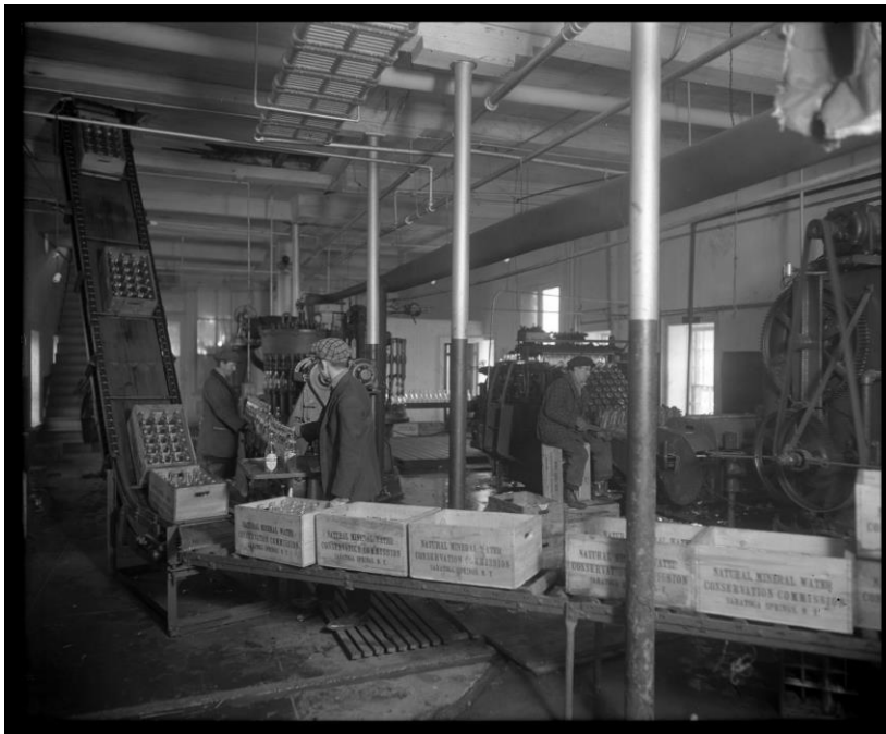
New York State Archives. Mineral Water Bottles Being Labeled at Saratoga Springs . Saratoga Springs, N.Y, November 1918. Image.

https://www.nysarchivestrust.org/exhibits/industrialization/factories/washing-filling-and-crowning-mineral-water-bottles-saratoga-springs