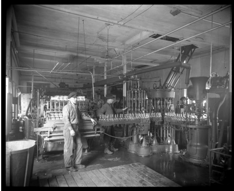
New York State Archives. Washing, Filling, and Crowning Mineral Water Bottles at Saratoga Springs . Saratoga Springs, N.Y. November 1918. Image.

https://www.nysarchivestrust.org/exhibits/industrialization/factories/washing-filling-and-crowning-mineral-water-bottles-saratoga-springs